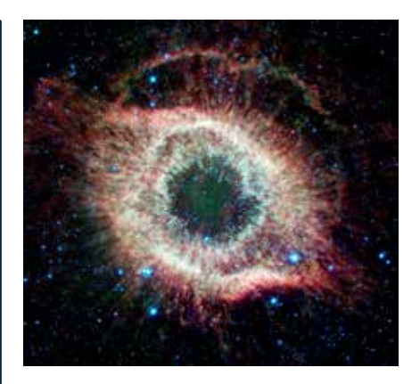
Cover: Bishop David writes, 'God challenges Job to contemplate the wonders of creation'. Page 7.